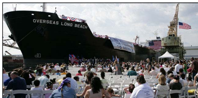
Naming ceremony for the Overseas Long Beach

After receiving certification from the US Coast Guard and ABS on the morning of the 26th, a flag ceremony was conducted on board the vessel, and Hull 006 was formally delivered on charter to OSG.