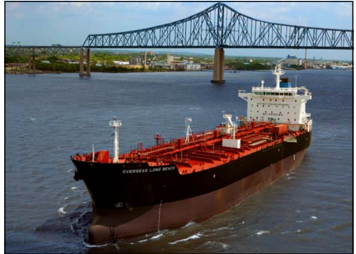
The Overseas Long Beach commencing sea trials

On Tuesday, June 26th, the second MT 46 Veteran Class product tanker in Aker Philadelphia Shipyard's build program and the second vessel owned by American Shipping Corporation was delivered to Overseas Shipholding Group (OSG). Three days later, the ship set forth from the yard to begin her service to BP Shipping, under that company's time charter with OSG.